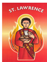
St Lawrence (red)