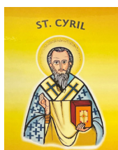
St Cyril (yellow)

This week we have 3 winning houses with 155 points. Congratulations to St Cyril, St Josephine and St Elizabeth!