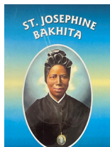
St Josephine (blue)