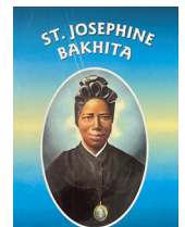
St Cyril (yellow) St Elizabeth (green) St Lawrence (red) St Josephine (blue)