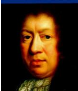
Pepys' Diary SAMUEL PEPYS