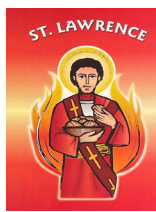
St Lawrence (red)