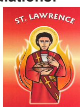
St Lawrence (red)