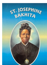
St Josephine (blue)