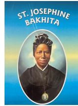
St Cyril (yellow) St Elizabeth (green) St Lawrence (red) St Josephine (blue)