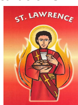
St Lawrence (red)