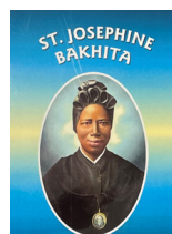
St Josephine (blue)