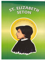
St Elizabeth (green)