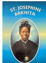
St Josephine (blue)