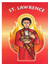
St Lawrence (red)