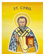
St Cyril (yellow)