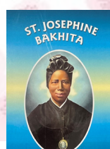
St Josephine (blue)