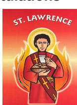
St Lawrence (red)