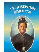
St Josephine (blue)