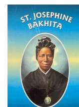
St Josephine (blue)