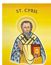
St Cyril (yellow)