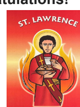
St Lawrence (red)