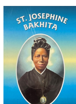
St Josephine (blue)