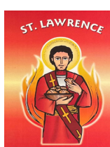
St Lawrence (red)